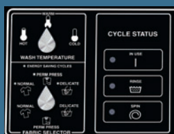
Electromechanical Control Two-Speed Washer