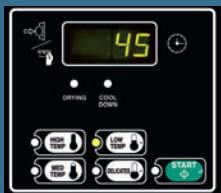
Micro-DISPLAY Control Dryer