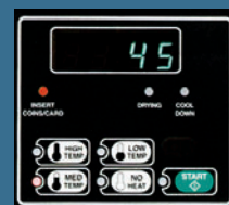
NetMaster Control Dryer