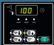
Micro-DISPLAY Control Water-Saver Washer

This control's digital display gives your laundry a more high-tech look. Our Micro-Display Control (MDC) shows vend price, while customers stay informed about the wash process through cycle status lights and a digital cycle count-down. MDC offers four cycle selections and comes with a single coin drop installed that is easy for store owners to program the vend price. The control also can interface with a variety of after-market card reader systems.