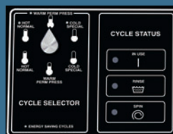
Electromechanical Control One-Speed Washer