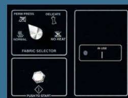
Electromechanical Control Dryer