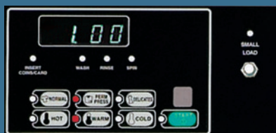
NetMaster Control Washer