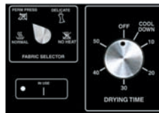
Manual Dryer Control