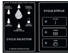
Manual Washer Control